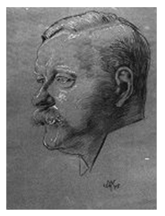
Figure 1 Picture of Friedrich. http://www.deboor.de

All wounds were digitally photographed on arrival and a wound swab was taken for bacteriological testing before wound cleaning. Depending on the amount of contamination, wounds were disinfected and debrided before they were sutured, using non-resorbable material, independent of time since trauma. This was done by the surgical resident in the ER present at that moment. The attending resident used a purpose-designed scoring form to register age of the patient, the type of wound (crush or sharp), the location (head, torso, upper extremities, lower extremities), depth and length of the wound, time and date of trauma, time and date of suturing, and type of wound care.