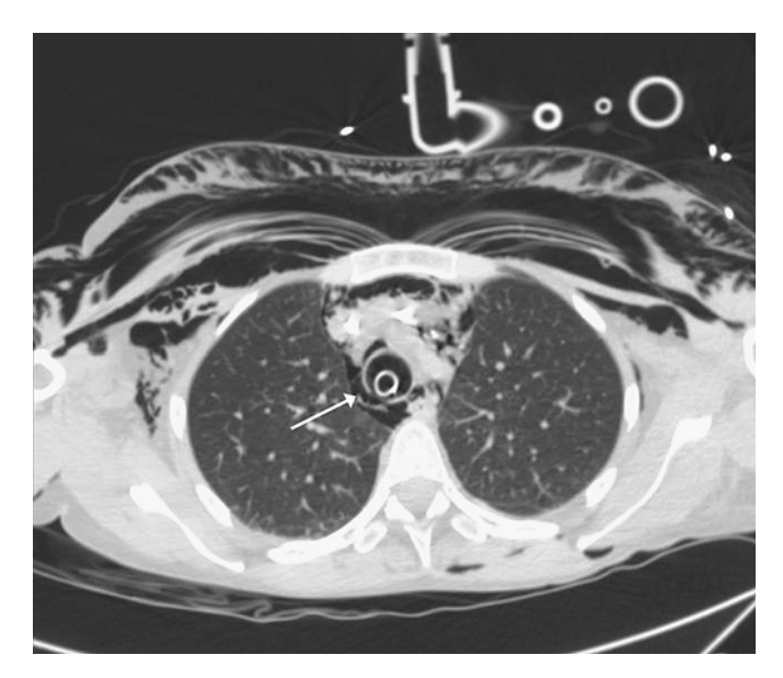
Figure 1 Thoracic CT scan demonstrating complete disruption of the potero-lateral tracheal wall (white arrow) with extensive pneumomediastinum and subcutaneous emphysema. The endotracheal tube can be seen in situ.

Patient consent The patient is deceased so no written consent was obtained. Unfortunately, no relatives were able to be contacted to consent on the patient's